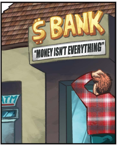
Their last slogan was "Money isn't everything."